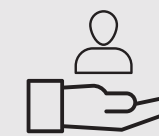
Youth Support Coordinator